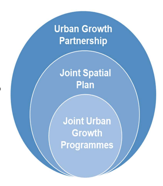
Figure 1: Components of Urban Growth Partnerships Programme